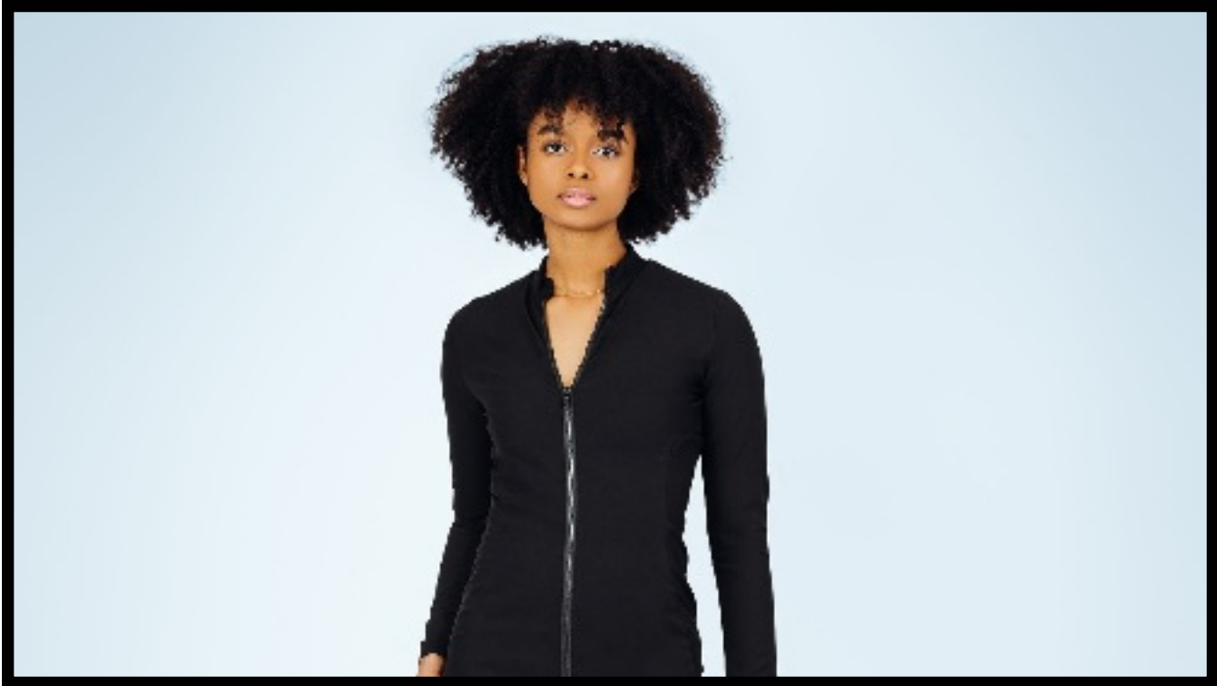
FASHION FORWARD | PAGES 12-15 Queen Is The Title: The new collection