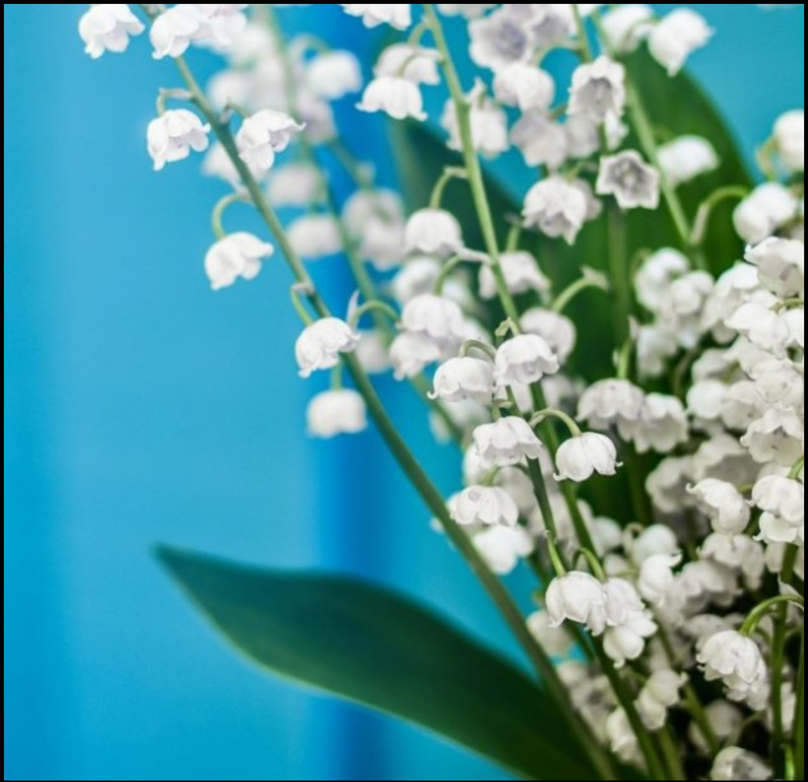
(A) NATURE Lily of the valley

Lily of the valley, sometimes written lily-of-the-valley, is a woodland flowering plant with sweetly scented, pendent, bell-shaped white flowers borne in sprays in spring. It is native throughout the cool temperate Northern Hemisphere in Asia and Europe. In Germanic mythology, lily of the valley flowers have been associated with the humility and purity of the virgin goddess Ostara. In Christian legend, Eve's tears turned into lilies of the valley as she was expelled from the Garden of Eden. A symbol of purity, joy, love, sincerity, happiness and luck, lily of the valley has much significance beyond the United Kingdom. It's actually the national flower of Finland, and in France, on 1st May for La Fête du Muguet, lily of the valleys are gifted to loved ones. The Lily of the valley is a bulbous flowering plant. It belongs to the Asparagaceae family. It is called the Covallaria Majalalis . It is a fragrant flowering plant with a nice scent and has a bell-shaped appearance.