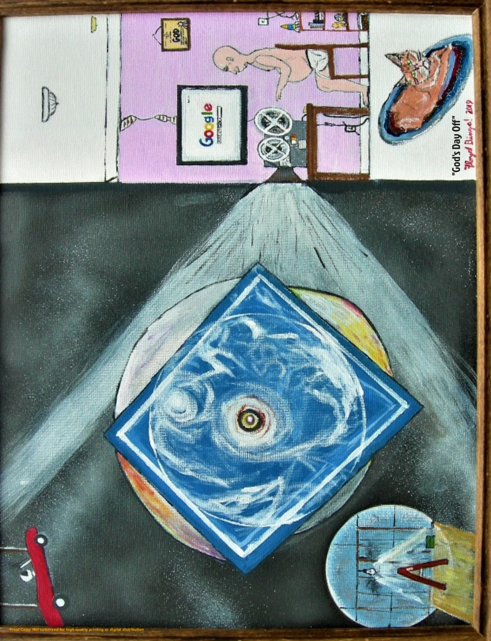
"God's Day Off" Royd Bingso, 2019